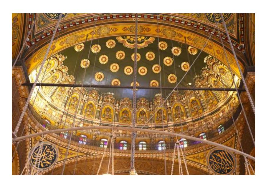
Your Itinerary, maps and weather